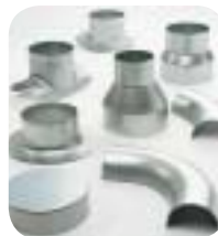
Air Duct Parts